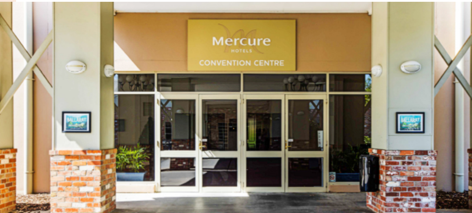
Mercure Convention Centre

To book your accommodation, please call (03) 5327 1200 or email: reception@mercureballarat.com.au and mention the RWAV 2024 Conference.