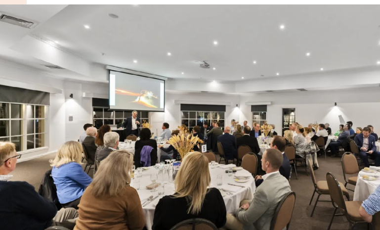
Eureka Ballroom Networking Dinner